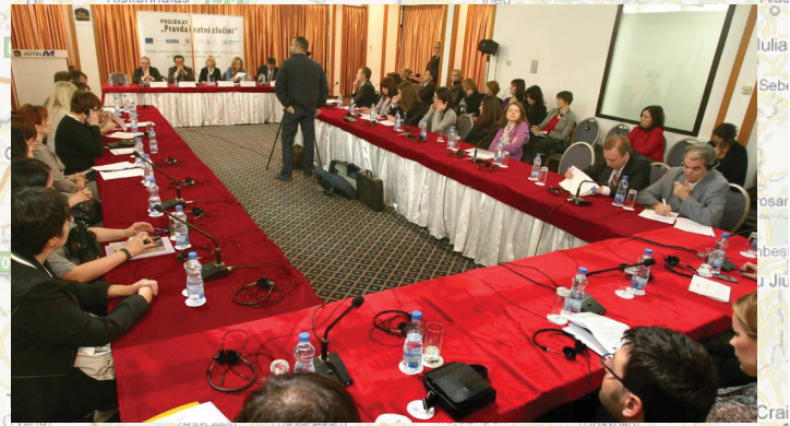
ICTY witness support experts with their regional counterparts at the peer-to-peer meeting in Belgrade, May 2011.

Participants discussed and shared experiences on different models of witness support systems in the region, the development of witness support services after trials, and the experiences of witnesses tes-